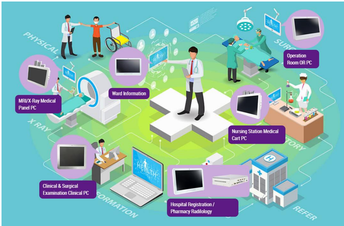
Figure 2. Dynamic electronic medical records (EMRs) can function as real-time documentation covering a patient’s lab results, status, and other pertinent information about their stay.