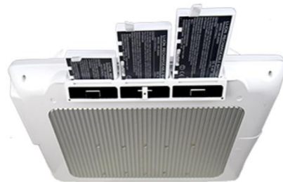
Figure 3. The integration of hot-swappable batteries makes the G series panel PCs highly suitable for mobile EMR applications.

G Series medical cart panel PCs are based on 7 th generation Intel® Core® processors and designed to meet the mobility, connectivity, and processing requirements of healthcare IoT edge networks. Given the significant amount of compute performance, memory, 128 GB SSD, and expansive wireless connectivity options, G Series PCs are perfectly suited as sensor hubs that can integrate data from nearby medical devices, perform AI-based image or streaming data analysis, and render EMRs for nearby healthcare professionals.